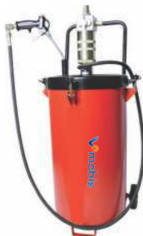
Air Operated OIL PUMP