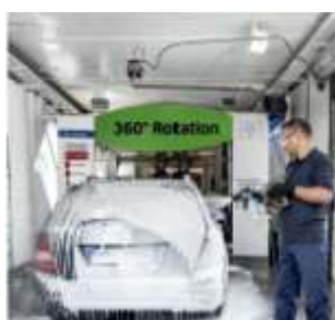
360° Swivel Arm Connectors for 360° Swivel Arm