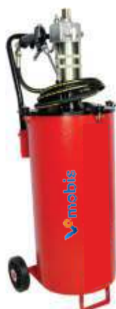
Air operated GREASE PUMP