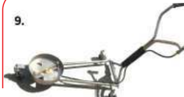
Underbody Lance (Rotating) Connectors