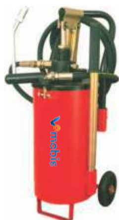
Hand operated GREASE PUMP